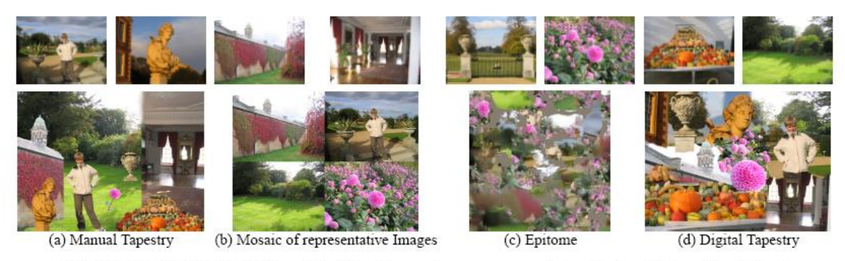
Figure 1. Tapestry comparison. Top: eight different images from a consumer photo collection. Bottom: Four different ways to visually summarize such a collection: (a) Manually created tapestry using commercial image editing software [1]; (b) mosaic of representative images; (c) shape and appearance preserving epitome [7]; (d) digital tapestry created with the proposed method.