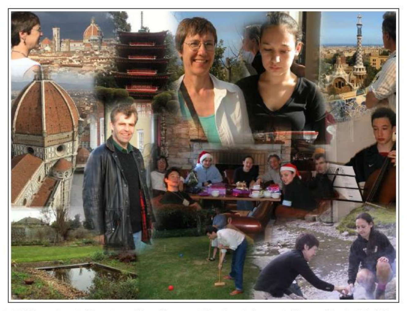
Figure 1: AutoCollage automatically creates a collage of representative elements from a set of images. Novel and desirable properties include: boundaries between images are appropriately positioned; there is little duplication of material; small and meaningless image fragments are avoided; faces are preserved whole; blends may either cut along natural boundaries or be transparent, decided automatically.

Carsten Rother, Lucas Bordeaux, Youssef Hamadi, Andrew Blake Microsoft Research Cambridge, UK*